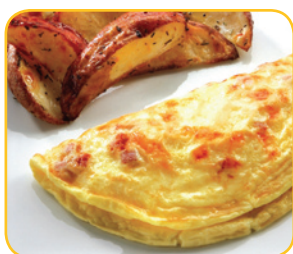
Center of Plate Entrée