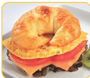
Croissant or Tortilla Wrap Component (folded)