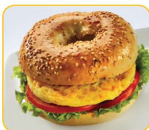
Sandwich Component (unfolded)