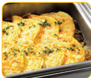
In a Buffet Casserole